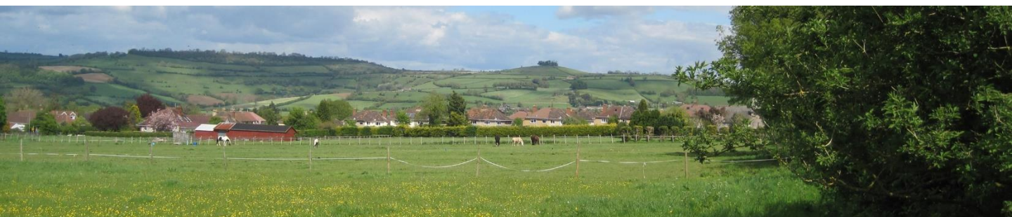
Viewed looking east towards Cotswold AONB from top west side of fields (May 2013)