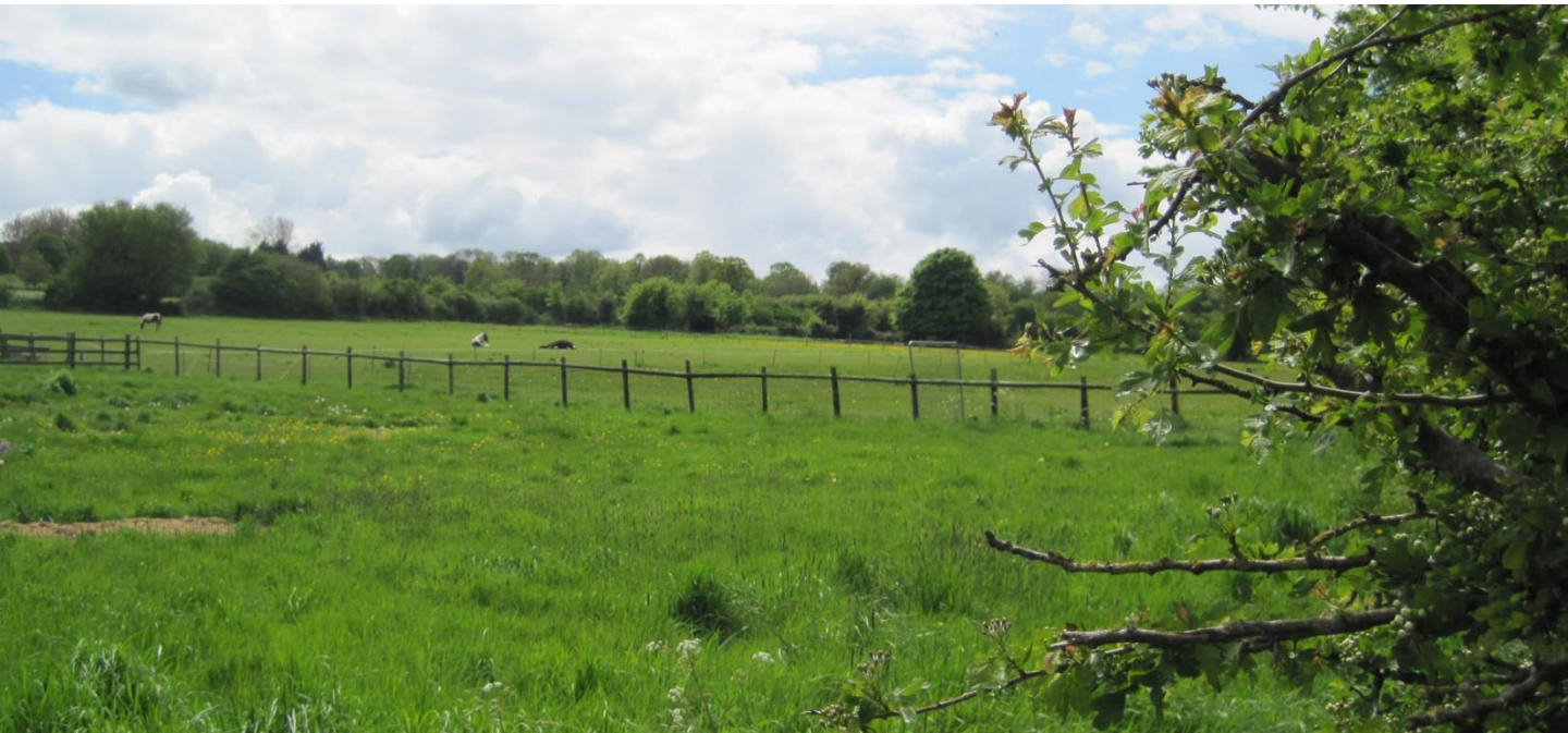
Viewed looking south west from Manor Rd; Longwood on RH side of photograph (May 2013)