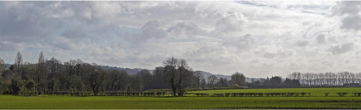
View eastwards from Longwood Lane over arable fields to Cotswold AONB (March 2020)