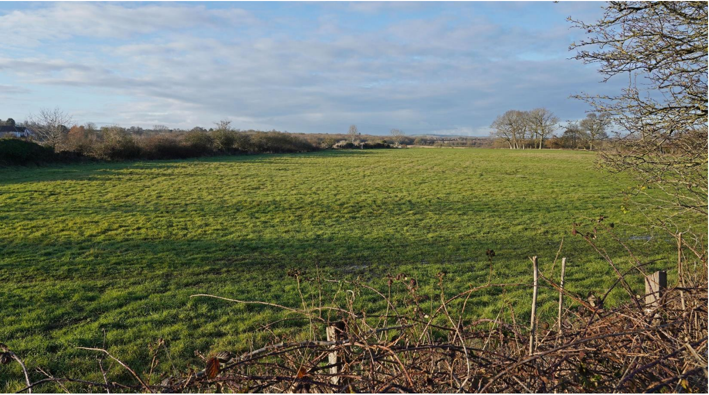
View south from the Bath Road A4 between Grange Rd and Copse Road (December 2022)