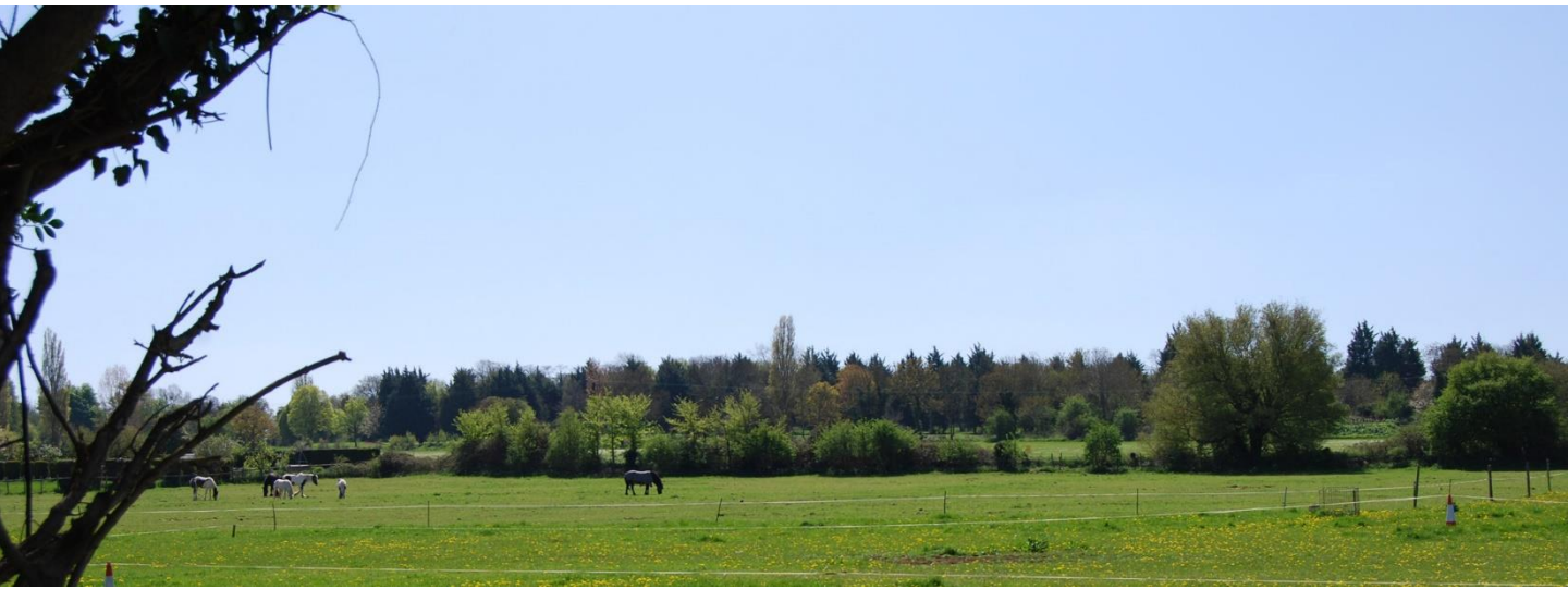
Viewed looking south from Manor Rd (May 2013)