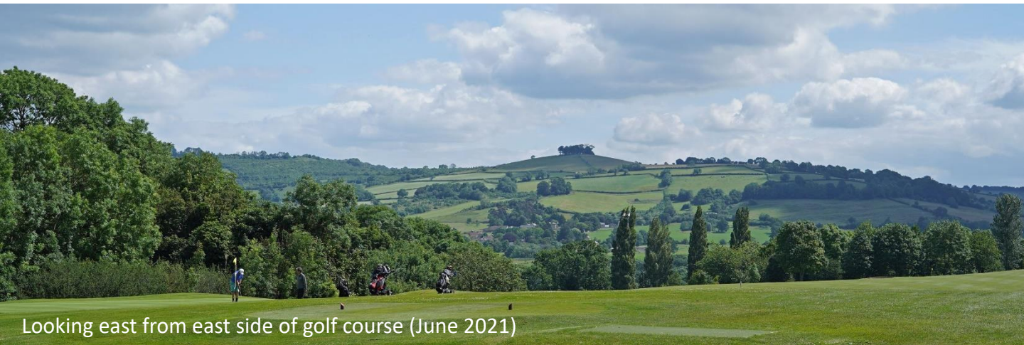
Looking east from east side of golf course (June 2021)