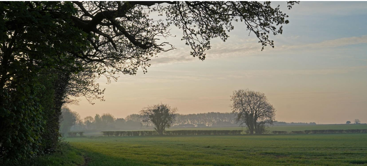
Fields above Longwood, east of Longwood Lane & south of golf course (in Corston) (April 2020)