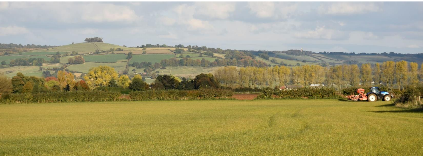
View eastwards from Longwood Lane to Cotswold AONB (October 2016)