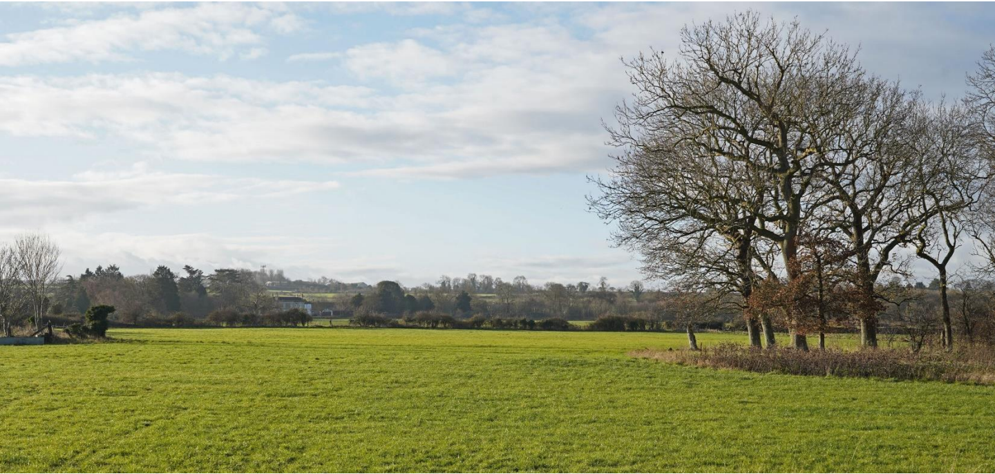
View south from PROW footpath behind Copse Road (December 2022)