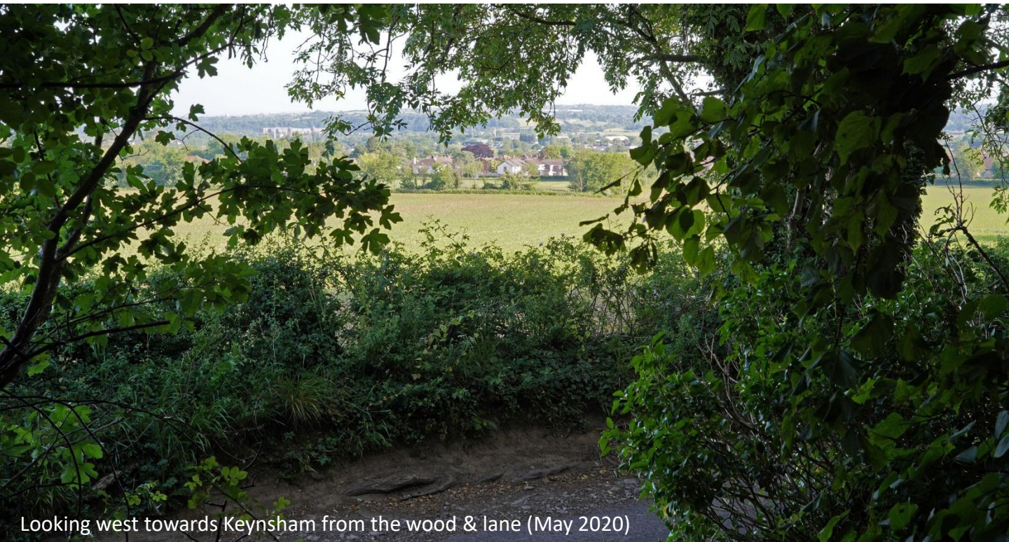
Looking west towards Keynsham from the wood & lane (May 2020)