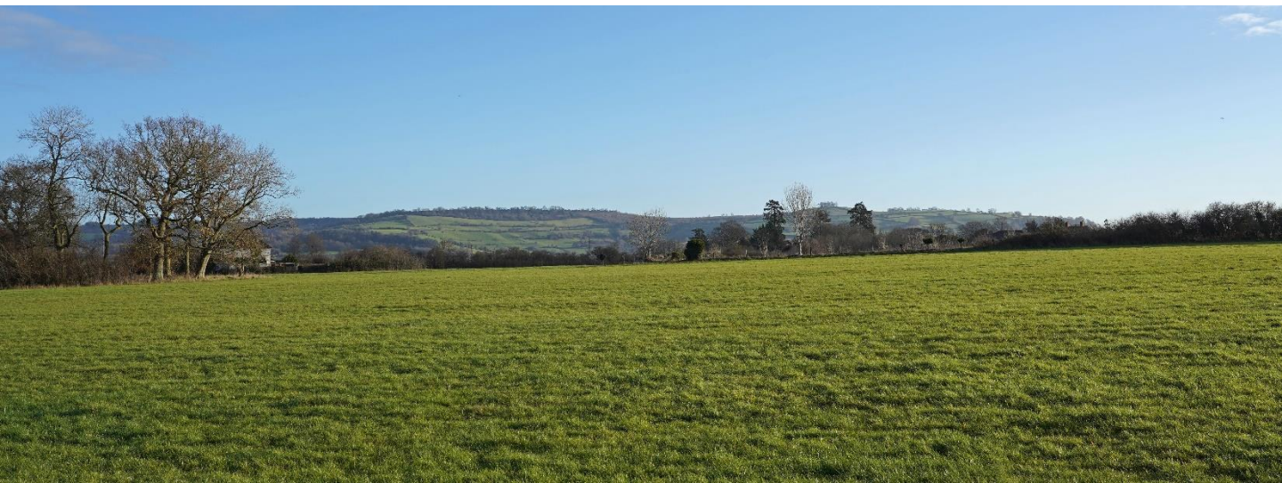
View south from PROW footpath behind and west of Copse Road looking east to Grange Road with Cotswold AONB on the horizon (December 2022)