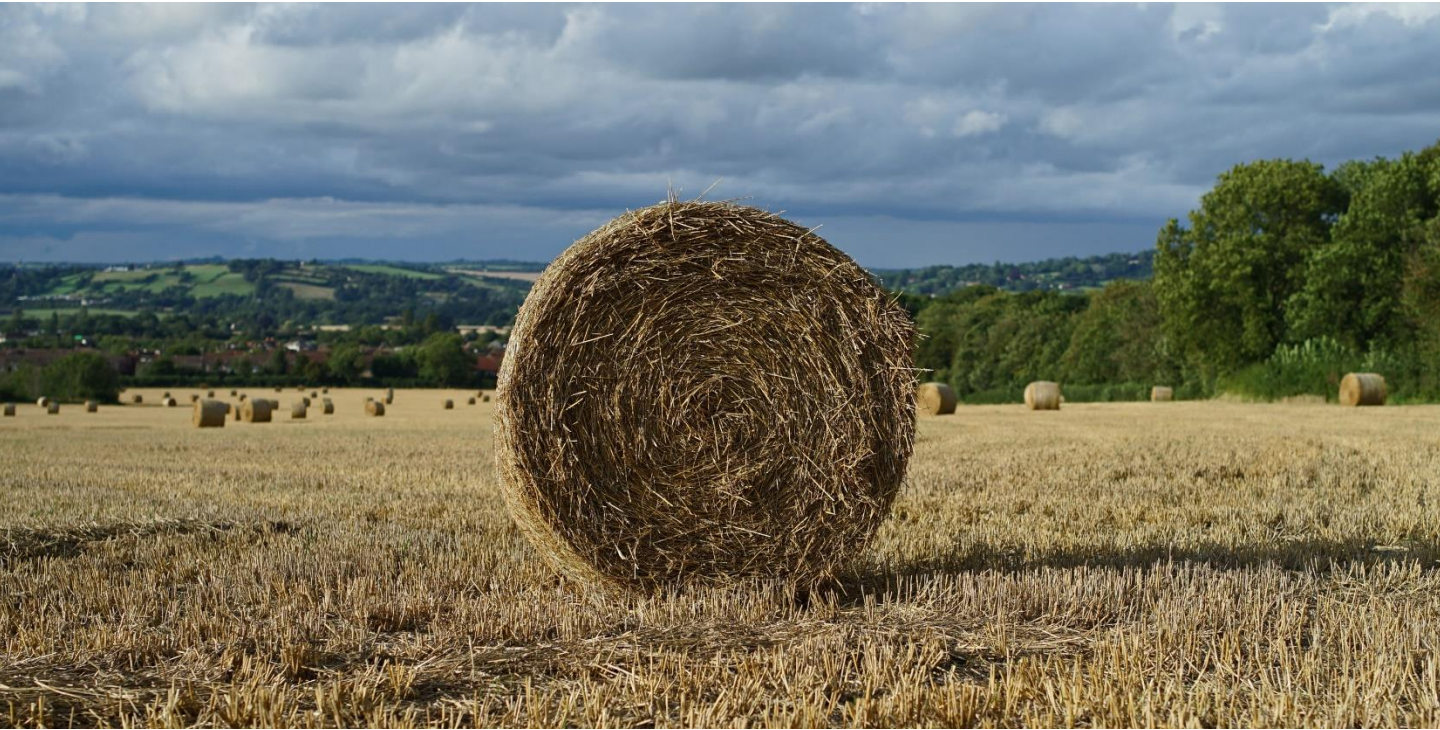
West field immediately north of Gypsy Lane; Longwood on right (August 2019)