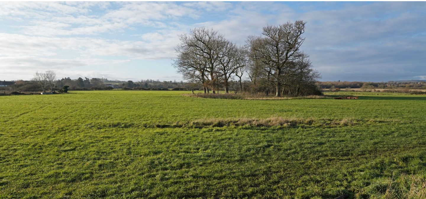
View south from behind Copse Road; Grange Road on the left (December 2022)