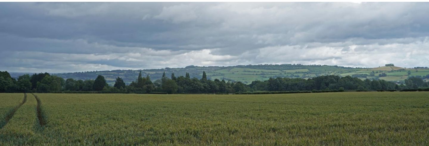
View NE from top of Longwood Lane / Ashton Hill to golf course parkland, Folly Wood & Cotswold AONB (June 2020)