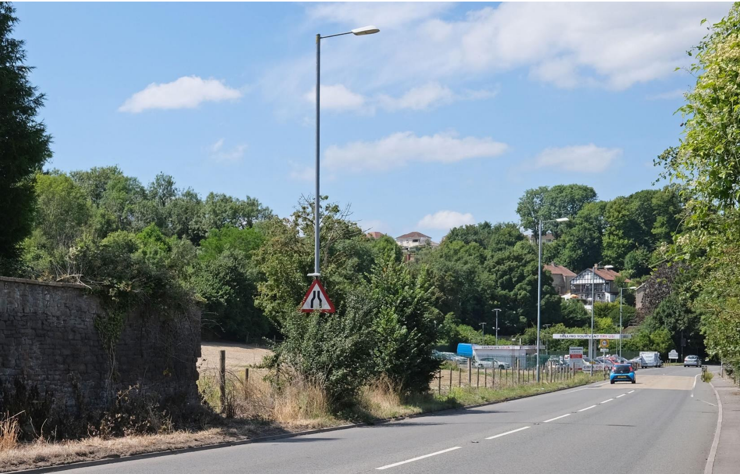
View eastwards from Bath Road A4. Northern end of Folly Wood in view (July 2022)