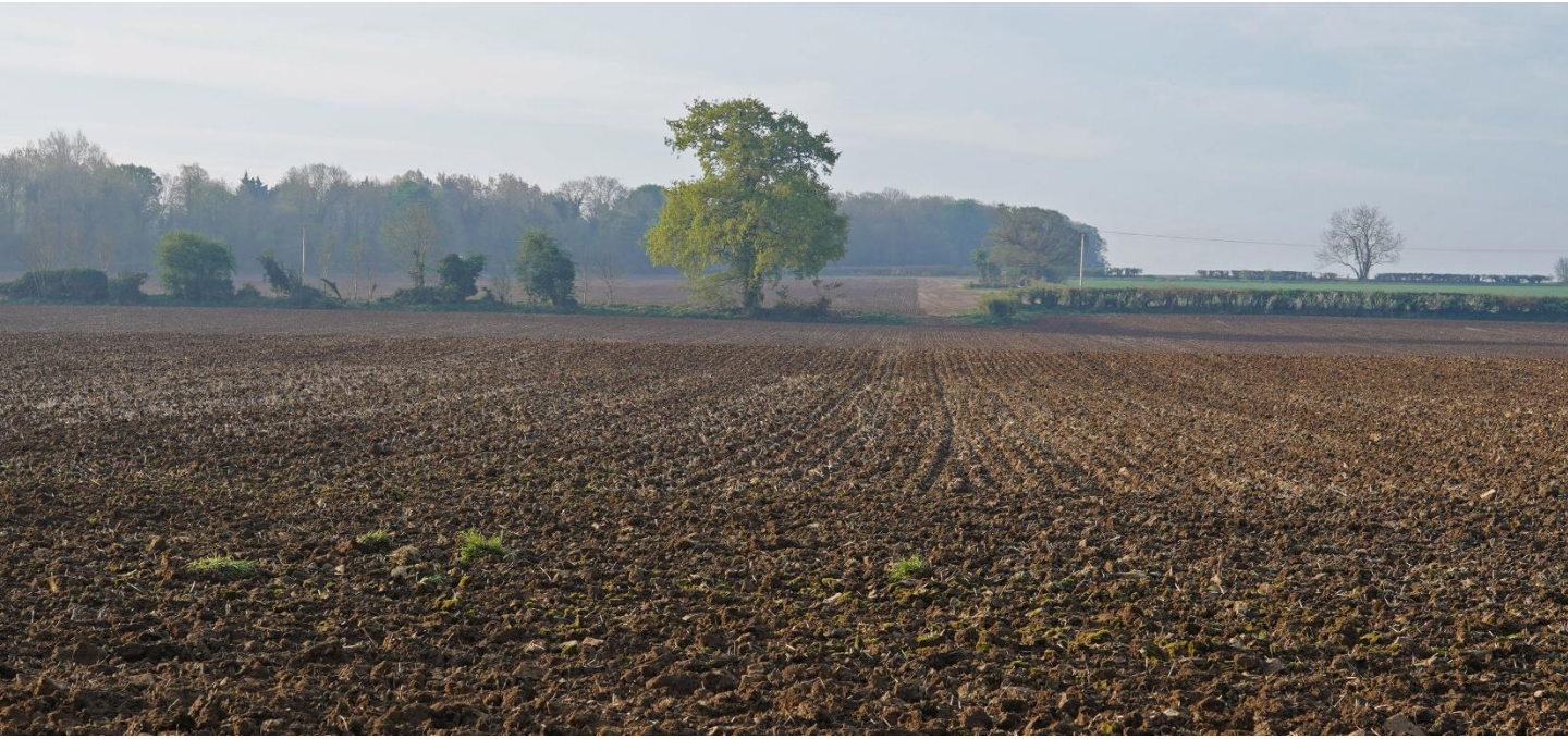
View south from Montague Road; Longwood on left (April 2020)