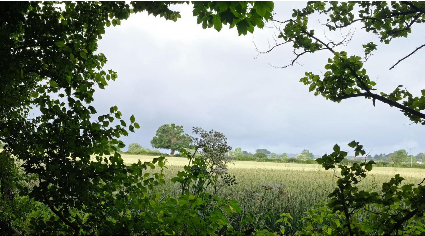
Looking west from the lane, c.mid point of Longwood (July 2021)