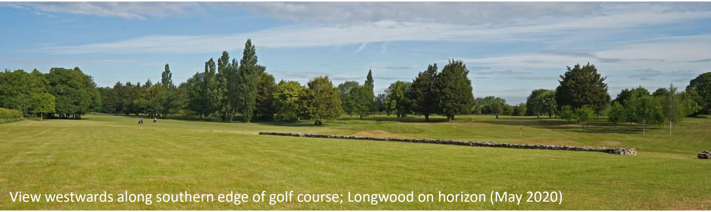
View westwards along southern edge of golf course; Longwood on horizon (May 2020)