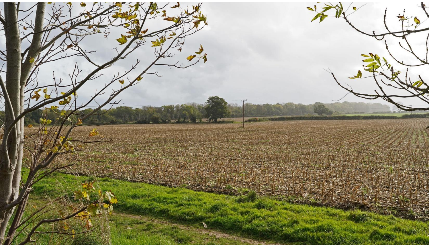
View south-eastwards from Manor Road (lane); permissive footpath & bridleway in foreground, Longwood on horizon (October 2022)